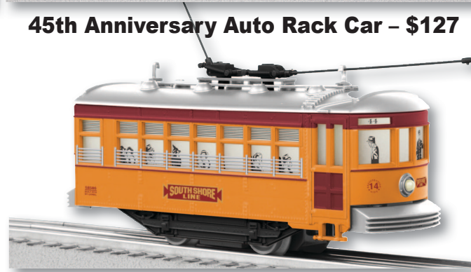
2014 South Shore Trolley – $120