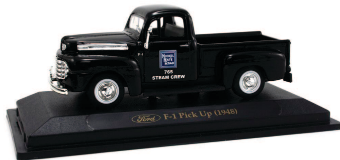
Black Die-Cast Steam Crew Truck – $35