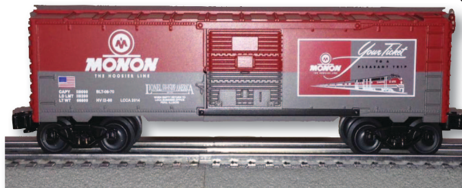
Monon "Train Ride" Car – $99

This is the last offering of these great 2014 LCCA Convention products to members before they are listed for sale on our website. We have a very limited number of these great club related products. Any product not sold by September 15th will be placed on the LCCA web store. SO ORDER TODAY!