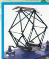
PANTOGRAPH RAISES AND LOWERS

Norfolk and Western, and Chesapeake and Ohio. They feature die-cast trucks and metal brake wheels, and are sequentially numbered 6456-1, 6456-2, and 6456-3. A 6427 Virginian N5c porthole caboose with interior lighting and die-cast trucks completes the set. Just a glimpse of this set will give you the distinct vision of the Virginian's proud history of coal operations in the mid-Atlantic region of the United States. (6-11934) Length of set: 4' 3" $499.95